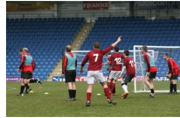
Proact Football game

Last week the whole company, customers and suppliers took to the field to play at the Chesterfield Football stadium and raised a total of £260